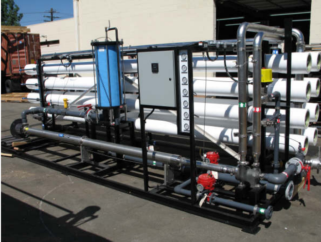
185,000 Gallon per day capacity Seawater Reverse Osmosis with HPB Energy Recovery System